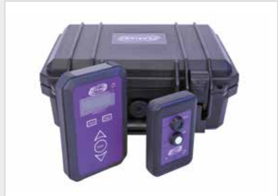
APOLLO 3.0 SINGLE KIT PACKAGE INCLUDES: Reader unit, Sensor unit, Calibration certificate, Carrying case.