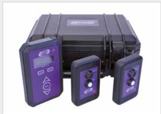
APOLLO 3.0 DOUBLE KIT PACKAGE INCLUDES: Reader unit, two sensor units, Calibration certificate, Carrying case.