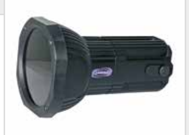
NO HANDLE No handle can be chosen and instead add a mounting bracket for fixed installation.