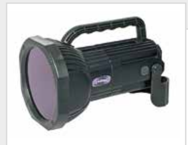
TOP HANDLE A top handle can be chosen instead of the pistol handle.

Light handheld device producing an extremely high UV intensity for use either inhouse or on the field by simply switching the docking device of mains with battery, both fit on the same lamp.