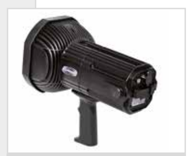
ON/OFF SWITCH On/Off switch at the back prevents accidental activation.