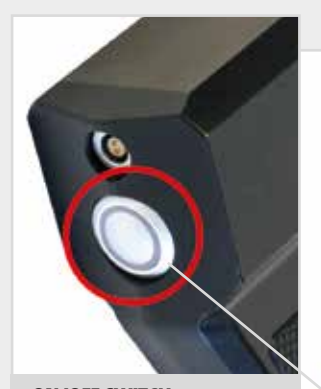
ON/OFF SWITCH On/Off switch at the back prevents accidental activation.

Probably the most durable UV light in the world today, suitable for any "heavy duty" environment! MB Hercules Ex is the first and only UV inspection light on the market today with explosion proof approvals that complies with ASTM E3022-15 and all PRIMES requirements, including Rolls-Royce RRES 90061 and Airbus AITM6-1001.