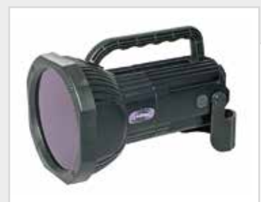
TOP HANDLE A top handle can be chosen instead of the pistol handle.

Light handheld device producing an extremely high UV intensity for use either inhouse or on the field by simply switching the docking device of mains with battery, both fit on the same lamp.