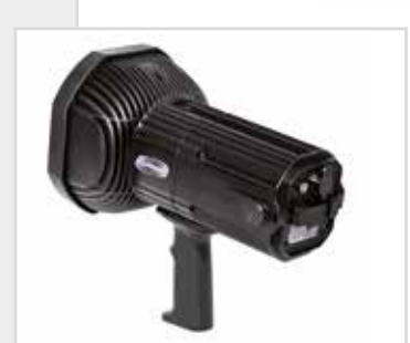
ON/OFF SWITCH On/Off switch at the back prevents accidental activation.