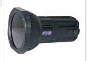
NO HANDLE No handle can be chosen and instead add a mounting bracket for fixed installation.