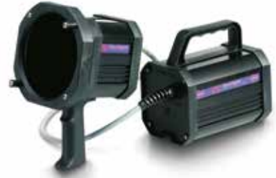
DUO PS135 – PISTOL HANDLE SHORT Two-part lamp consisting of a light weight luminary unit with pistol handle and a ballast (electronics) unit can be selected.