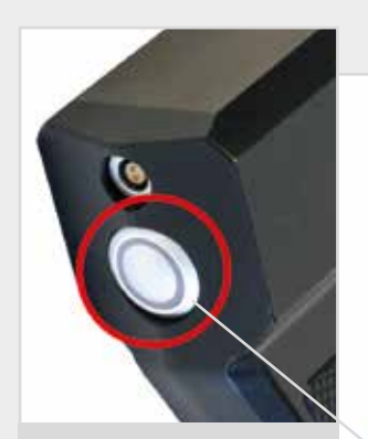
ON/OFF SWITCH On/Off switch at the back prevents accidental activation.

Explosion proof handheld UV inspection light to safeguard your human resources and physical assets.